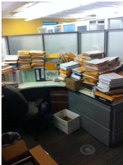
2014 Before Electronic Reporting (Approximately 2,400 paper submissions)