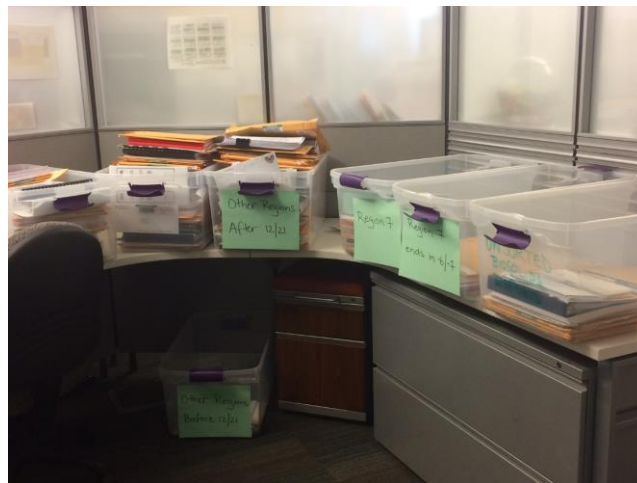
2017 1 st Year of Electronic Reporting (2,183 electronic submissions with 640 paper submissions).