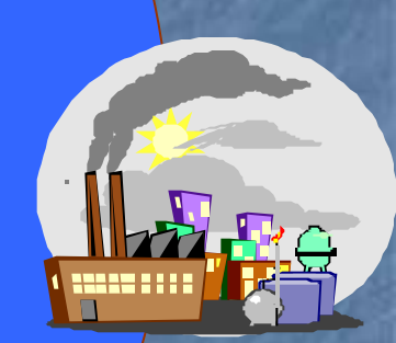
APC & ERC